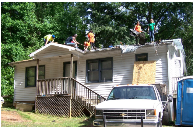
The SOS team repairs and reroofs this house in Henderson.