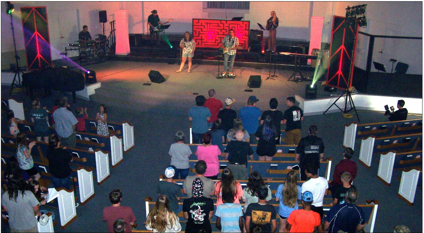
Praise and worship services Tuesday-Friday evenings at Central Baptist Church helped campers understand the theme of the week, Purpose Defined, based on Jeremiah 33:3. Speakers encouraged campers to "Be Thankful," "Be Holy," "Be Gospel-worthy," and "Be Bold."