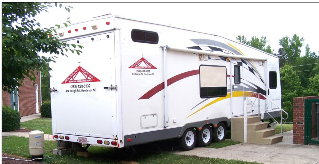
One of two Rebuilding Hope shower trailers is pictured. Central Baptist Church provided sleeping accommodations at its fellowship building for females and at its youth building for males. One eight-shower trailer was stationed at each location.