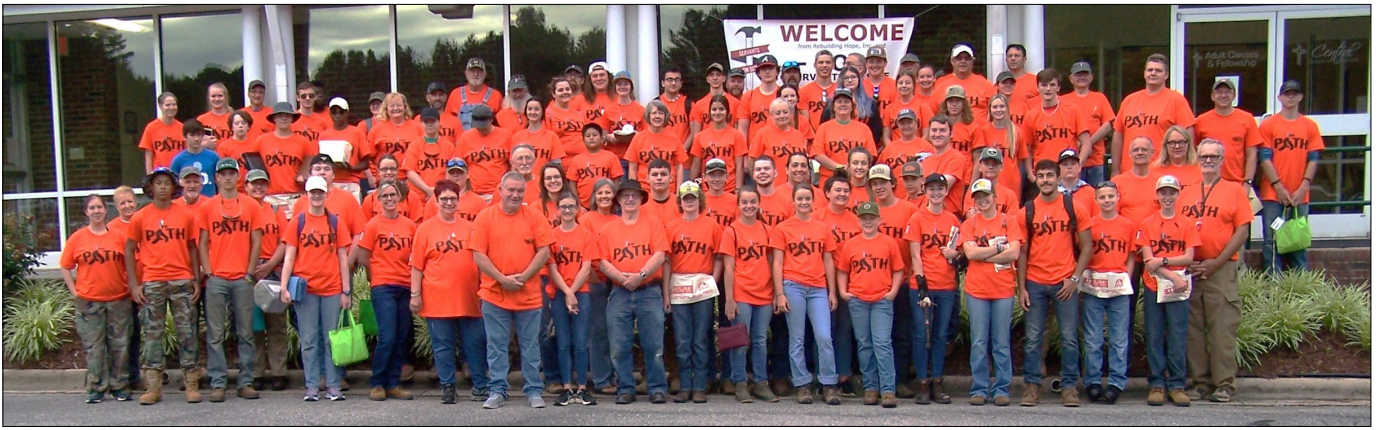
The 2022 Servants on Site assemble June 20 for a group photo before heading out to job sites in three counties.