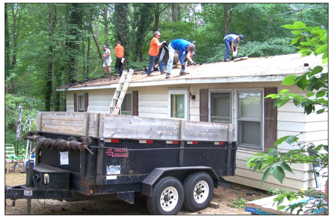
This roof job in Vance County is one of 10 completed by Servants on Site volunteers.