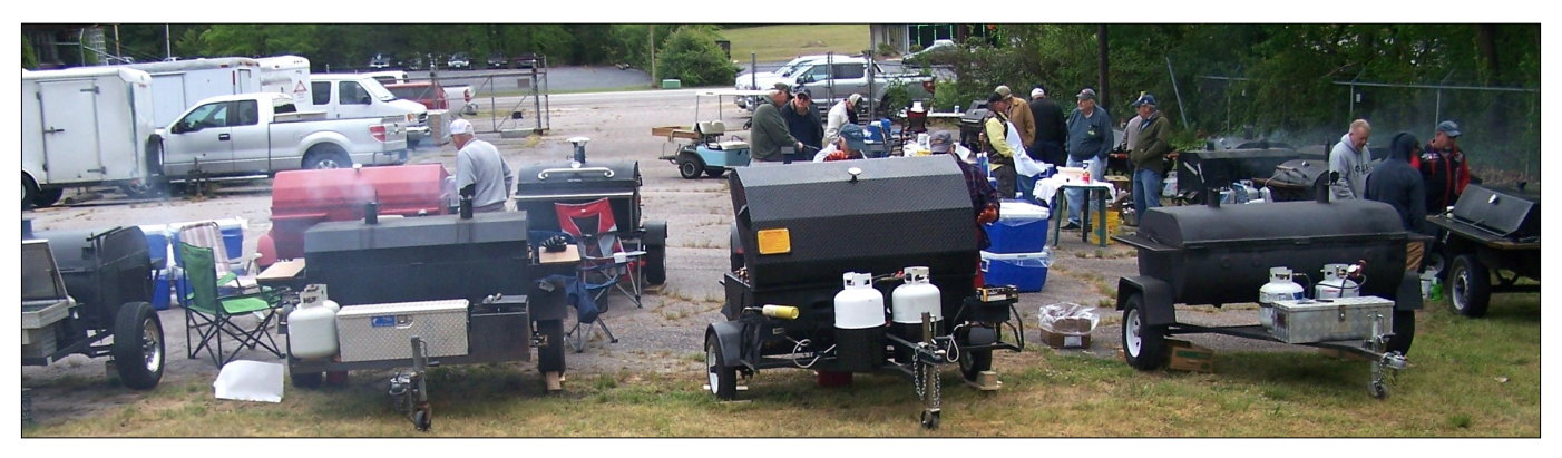
The aroma was back in the air April 29 as volunteers fired up their cookers.

Canceled for two years because of the pandemic, the Rebuilding Hope Spring Barbecue Chicken Fundraiser was back on its usual last Friday in April. Thanks to all the volunteers who returned to their usual tasks of cooking the main course, donating desserts and preparing plates — as well as visiting and enjoying fellowship with one another. Volunteers served served about 1,300 plates. Watch this newsletter for details about the fall fundraiser on Sept. 30.