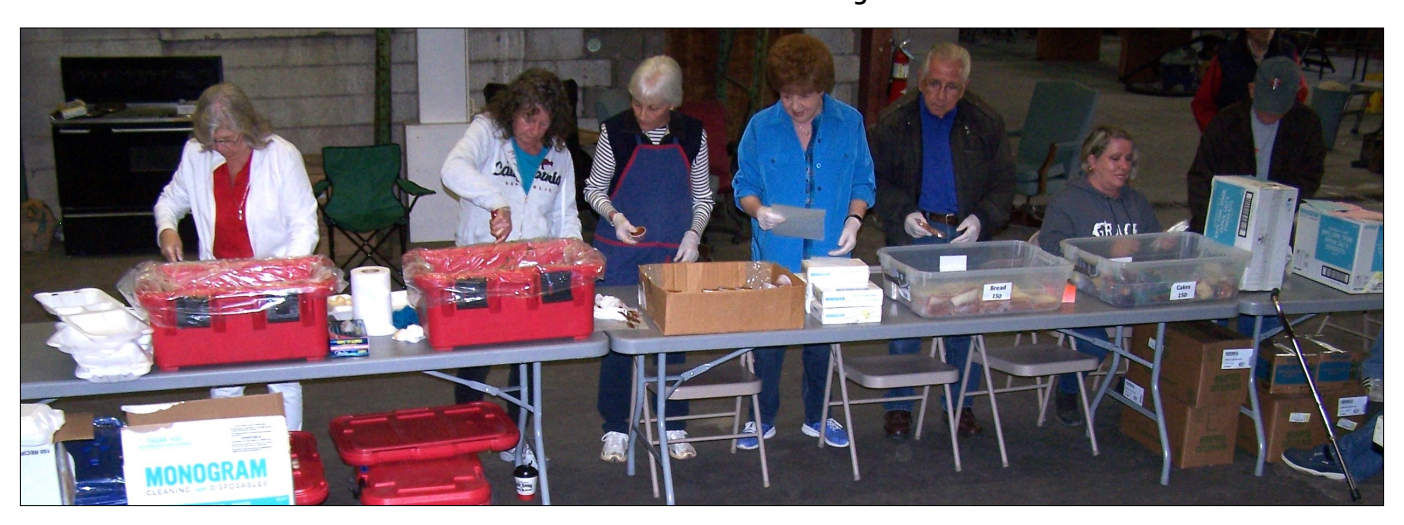
Plates are filled with chicken, green beans and potatoes. More photos, next page.