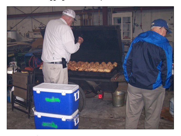
Sheltered from the rain in the maintenance and storage building, volunteers keep an eye on the main course.