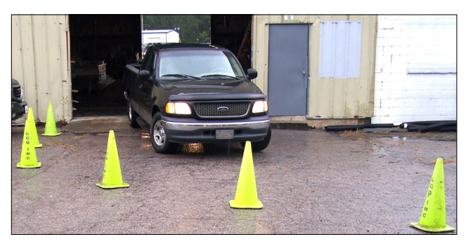
Everyone kept dry on fundraiser day thanks to the garage doors at each end of the warehouse. From top to bottom, customers entered the warehouse, volunteers loaded orders, and exit was at the rear.