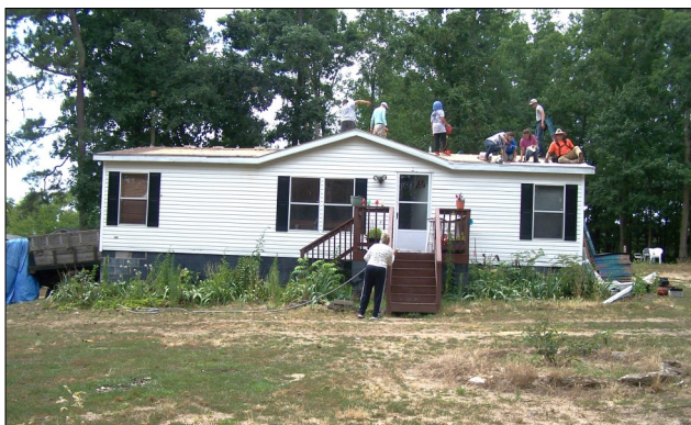
The Ladder Leapers’ job is in the Finch Road area.

“Rebuilding Homes, Lives and Hearts” is the mission to which God has called us. With humble hearts, the ministry strives daily to be faithful to that calling.