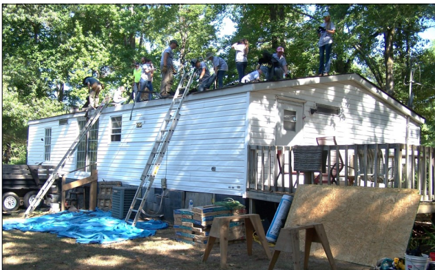
Servants on Site tackled six roof jobs during their week of work. Three were in Vance County and two in Warren County by the Jigsaw Jammers and Nail Gunners teams and one in Granville by the Fascia Fixers team. The job above by the Drip Edgers team is in the Deerfield Run area.