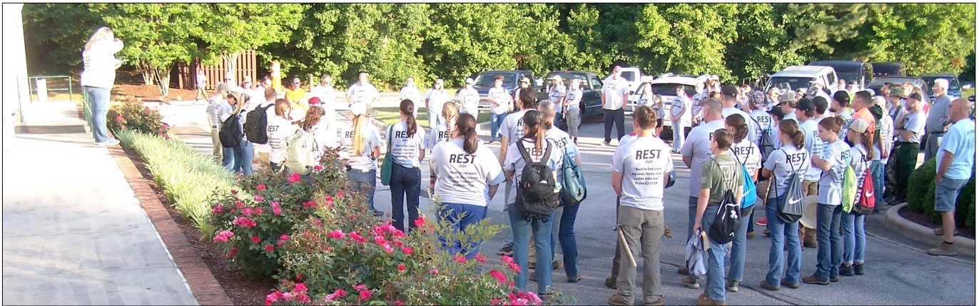
Servants on Site gather for instructions and prayer at the Departure Rally on the first day of work.