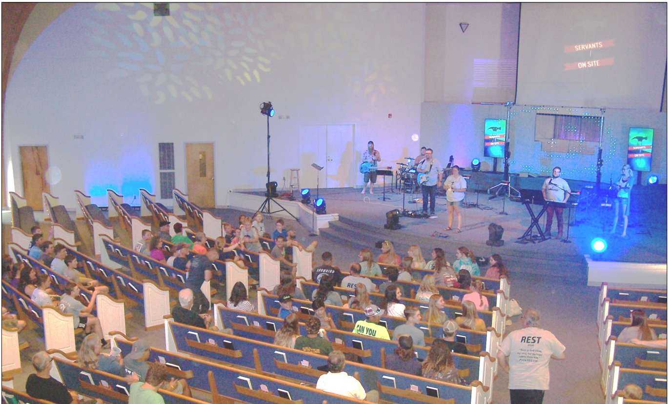
Praise and worship services each evening help campers understand the week’s theme, “Rest,” which is based on Psalm 62:5. The SOS song, printed below, is sung at each service.