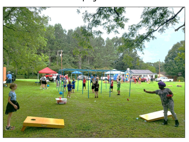
Various games in the game trailer were enjoyed during a outreach program at Franklinton Baptist Church.