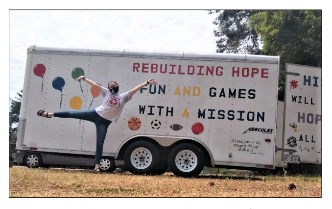
The game trailer even made its way to Raleigh for an outreach carnival sponsored by the Catholic Campus Ministry at N.C. State.