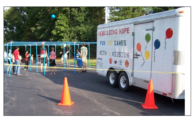
Central Baptist Church has used the Rebuilding Hope game trailer in several outreach programs.

How to Bring a Group to Rebuilding Hope and Building Wheelchair Ramps: Answers to Your Questions