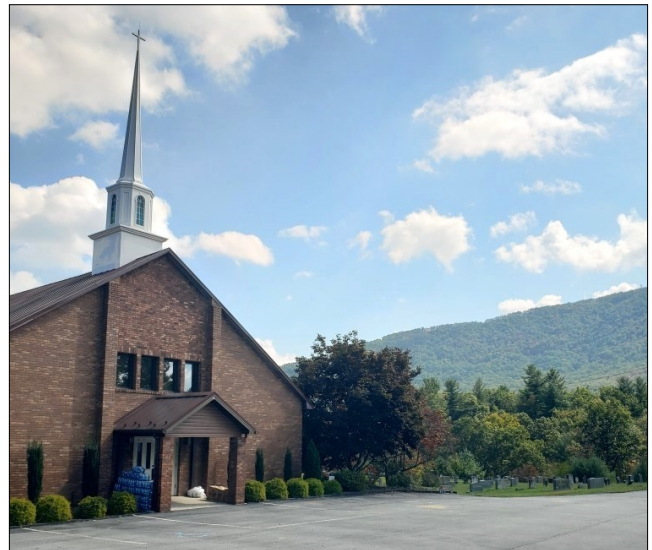
This tranquil scene at Crab Creek Baptist Church near Hendersonville belies the devastation in the mountains beyond. The church was a collection point for supplies for victims of Hurricane Helene.

While services are provided at no cost, donations from applicants are appreciated.