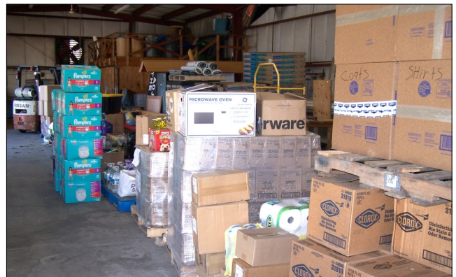
Some of the donations of supplies collected at the Rebuilding Hope warehouse and delivered to victims of the hurricane in western North Carolina.

Rebuilding Hope has also received money donations to help storm victims. The funds will be distributed as need arises.