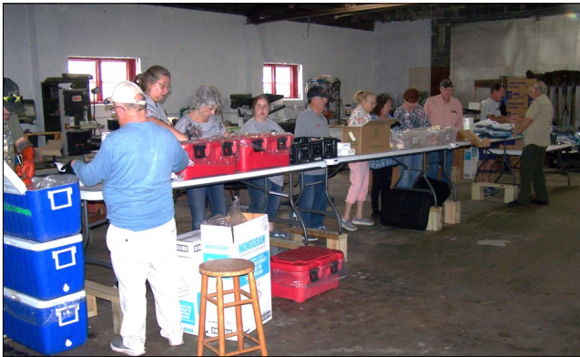
...to the serving...