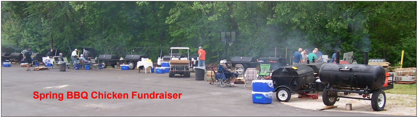
From the cooking...