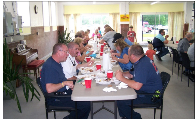
...to the dining in...