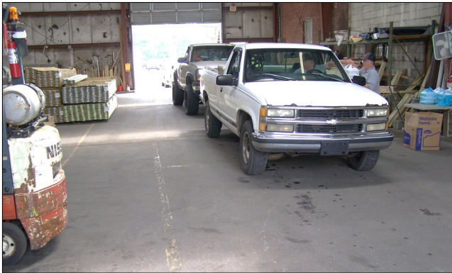
...and the driving through...

our spring fundraiser brought volunteers and friends together once again. We are thankful for all your support. Without your support, meeting the needs of our communities would be impossible. Continue to pray for us as we reach our communities with the gospel of Jesus Christ.